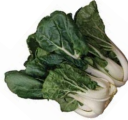
Baby Buk Choy