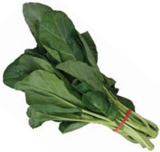
Gai Lan (Chinese broccoli)