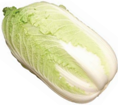
Wombok (Chinese cabbage)