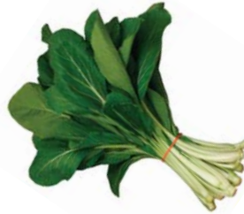
Baby Choy Sum